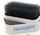
Suede and nubuck sponge